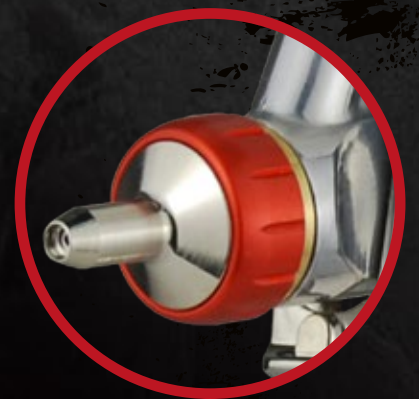
R5 Aircap Maximum precision